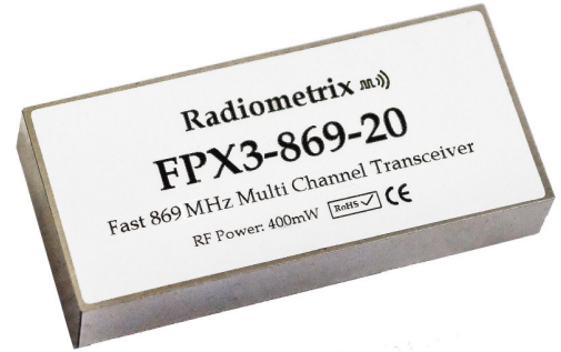
Figure 1: FPX3-869-20

FPX3 is a small, high power (half-watt) multichannel wide band FM transceiver, operating in the Europe-wide 869.40 - 869.65MHz subband. It is also available in the Indian licence free 865-867MHz band (General telemetry and RFID).